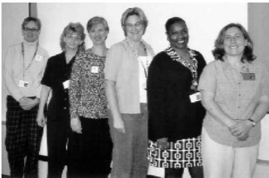
Highland Hospital Nursing orientation, June 2003

I received a copy of a letter that a cornea recipient sent to the agency. In it the recipient told how she was able to obtain her driver's license and how happy it made her that she could now come and go as she pleased. She no longer was dependent upon others or public transportation. The thought of not being able to spontaneously just hop in my car and go somewhere just struck a nerve in me. I think of that often. I also think about the donor families. At a moment when their lives have just changed forever because of the death of a loved one, they have the presence of mind and ability to sign that consent form. If they can do that, then I could—and should—be able to haul myself out of bed and help them make this gift possible.